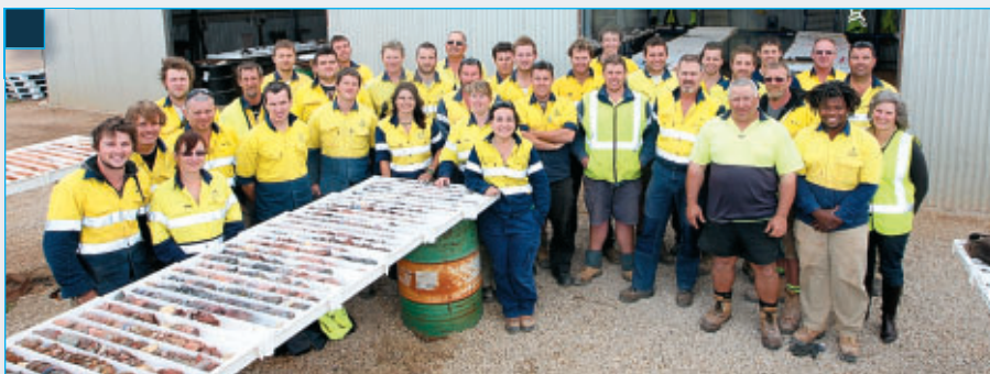
Field staff and geologists working for Rex at the Hillside site.

Rex has recently engaged an employment agency to assist in managing our workforce and to keep a record of those who may be interested in work opportunities with Rex. If you are interested you can register your interest at the following website: www.peopleatwork.com.au