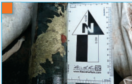
An example of drill core from Equis showing copper sulphide mineralisation.

For more on our Regional Exploration Program follow this link: www.rexminerals.com.au/projects