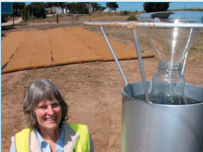
An example of a static dust station for collecting base line dust levels – 14 dust stations have been set up within a radius of 6km of the Hillside project area.

Surveys of the plant and animal species and their distribution on land and in the marine environment are currently underway. Normal or background information on dust and noise levels, water quality and supply assessments, traffic counts and other environmental parameter is being collected over the next few months.