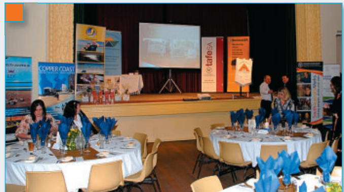
Setting up for the 'Celebration of Employment Awards 2011'.

Rex was a proud sponsor of the 2011 Yorke Celebration of Employment Awards. Regional Development Australia Yorke and Mid North, in conjunction with the District Council of the Copper Coast, District Council of Yorke Peninsula, District Council of Barunga West and Wakefield Regional Council, hosted the event which highlighted the importance of employment and training to the region, and celebrated the achievements of Trainees and Apprentices and Employers. Next year's event will be held in Ardrossan in October.