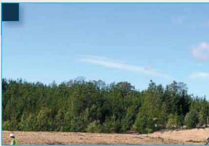
An example of a vegetated earth buffer screening an open cut mine.

These buffers will be vegetated and also be noise and dust barriers.