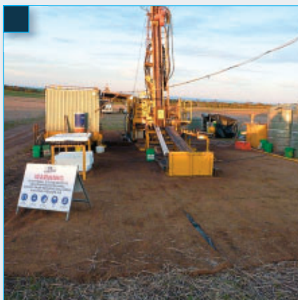
Drilling using a diamond drill rig.