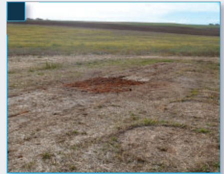
Rehabilitated drill pad area ready for seeding.