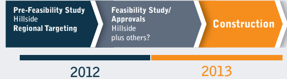
Proposed time line for PFS and feasibility study at Hillside.

Moving from a PFS to a 'Feasibility Study' adds another level of confidence to the project in order to determine if the project can proceed. It ensures that the technical, economic, environmental and social objectives required for mine development approval have been met. It is also important for raising the necessary debt/equity capital for developing a mining project.