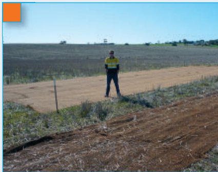
Dave McLean, Environmental and Land Management Officer inspects the fibre matting drill pad ready for the drill rig.

The drilling process lasts for up to 3 weeks depending on the depth of the drill hole and the rock types intersected. Once completed the matting is removed, the land rehabilitated and agreed compensation is paid to the landholder for any economic loss and inconvenience. We are continually working with farmers to improve our procedures to reduce our impact.