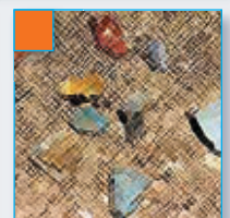
Some examples of heritage items and sites found on the Yorke Peninsula.