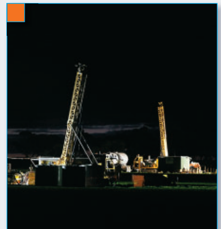
Hillside rigs at night.

The Hillside site is an exploration work site and for OH&S reasons entry is restricted to authorised personnel. We are proposing public site visits later in the year. These will be advertised in the local media. In the meantime, if you are driving past Hillside on the Main Coast Road you will see the drilling rigs in action.