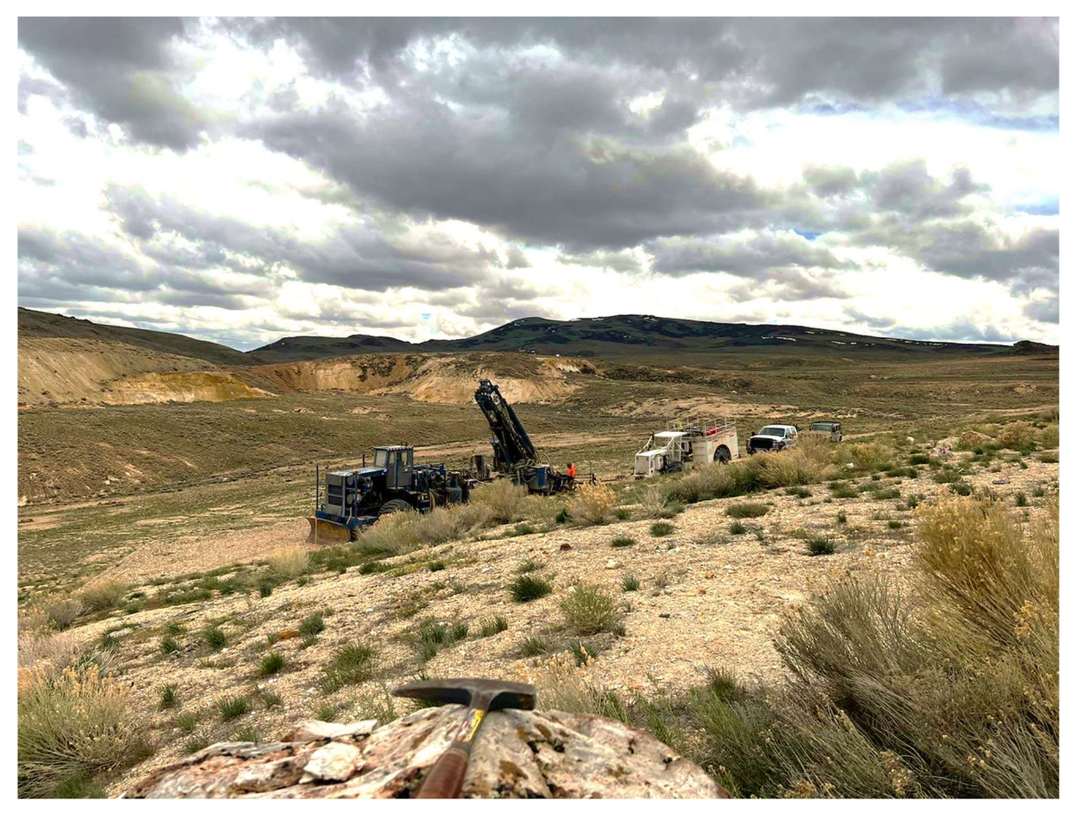
Figure 1: O'Keefe Drilling RC rig set up on the first drill hole for the Hog Ranch 2022 field season at Krista. Then 24 hours later, an overnight late season dusting of snow.