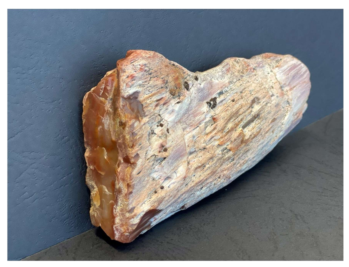
Figure 4: Silica Sinter containing fossilised plant material from the Gillam Prospect area.