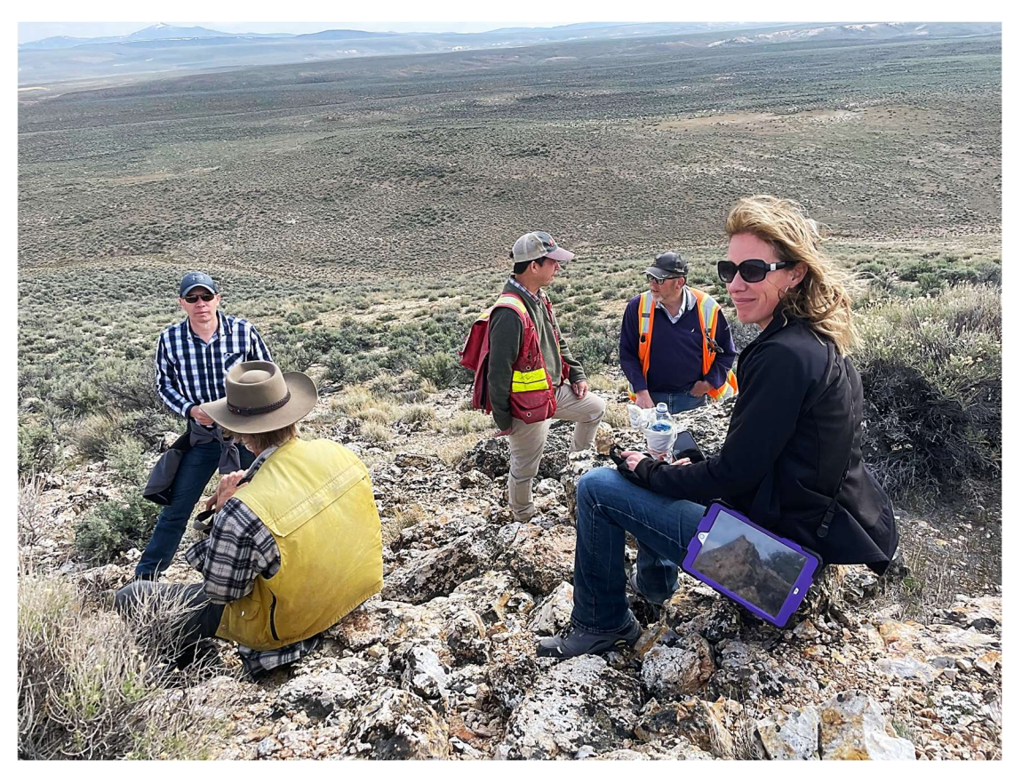
Figure 3: The team on the Gillam Prospect outcrop area.