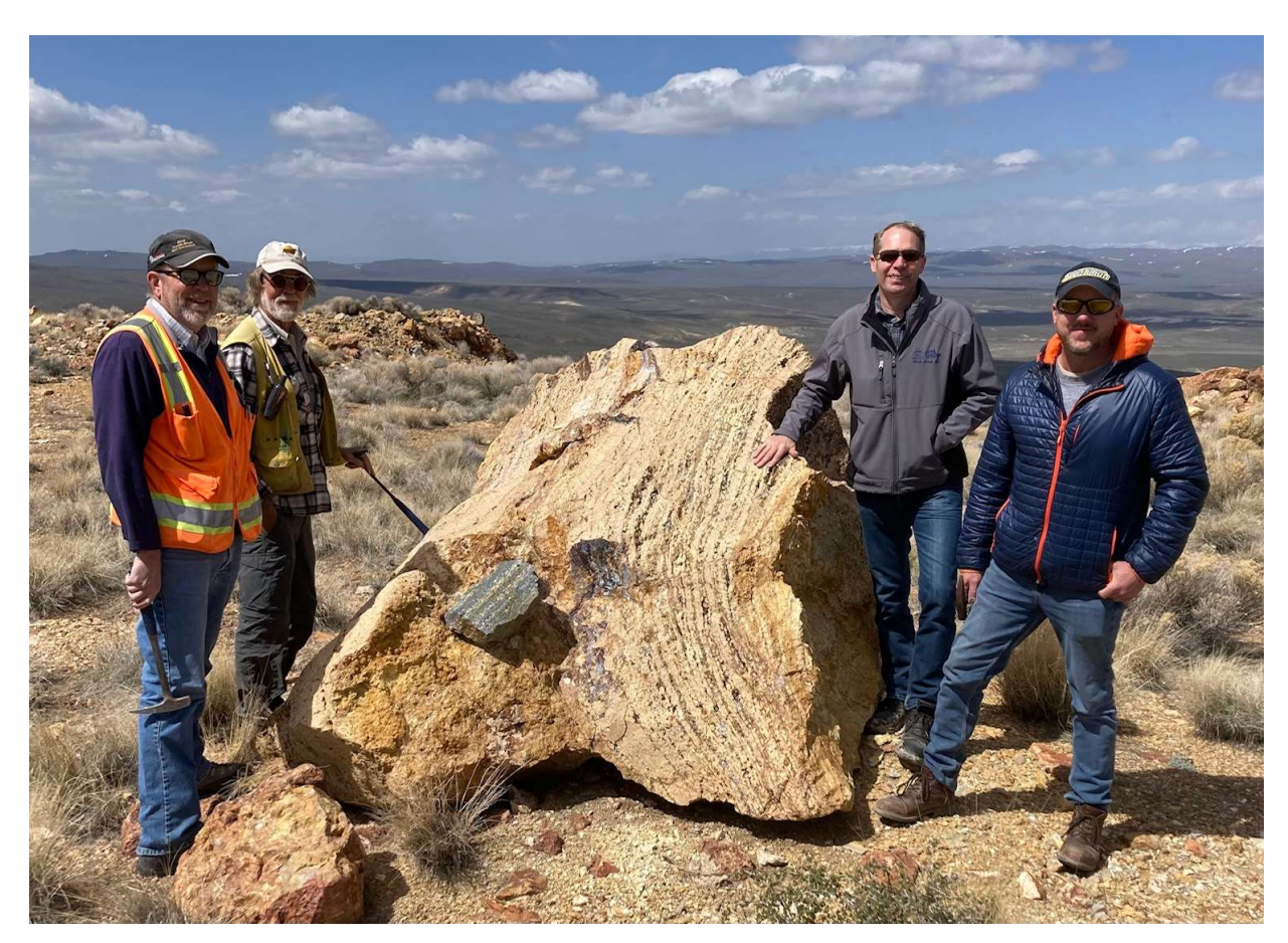
Figure 6: Gold bearing spherolitic rhyolite siting on the surface at the Bells Project area.

This announcement has been authorised for release by the Chief Executive Officer/Managing Director.