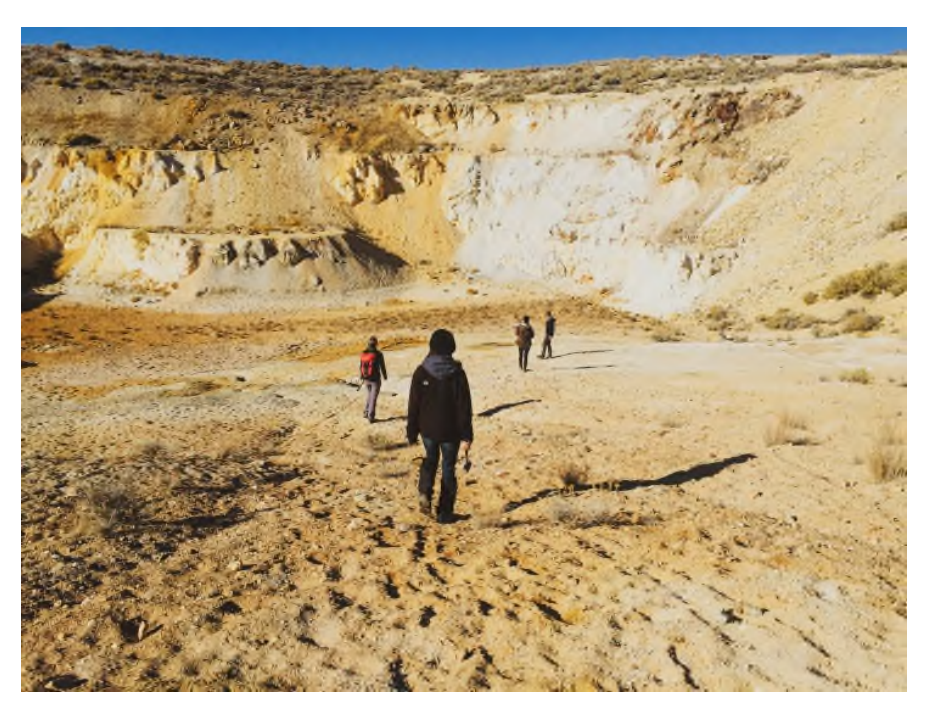
Figure 3: Site inspection - Reclaimed Geib Open Pit