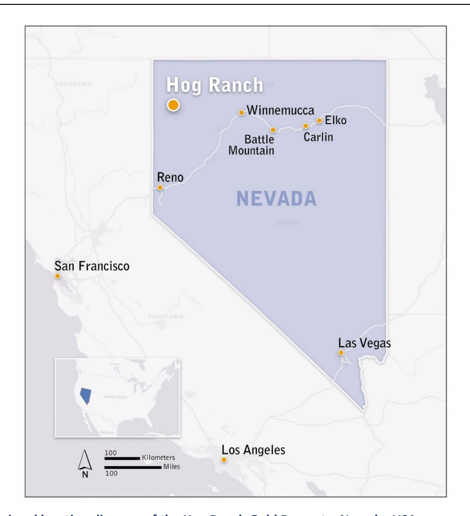
Figure 6: Regional location diagram of the Hog Ranch Gold Property, Nevada, USA

For more information about the Company and its projects, please visit our website 'www.rexminerals.com.au' or contact: