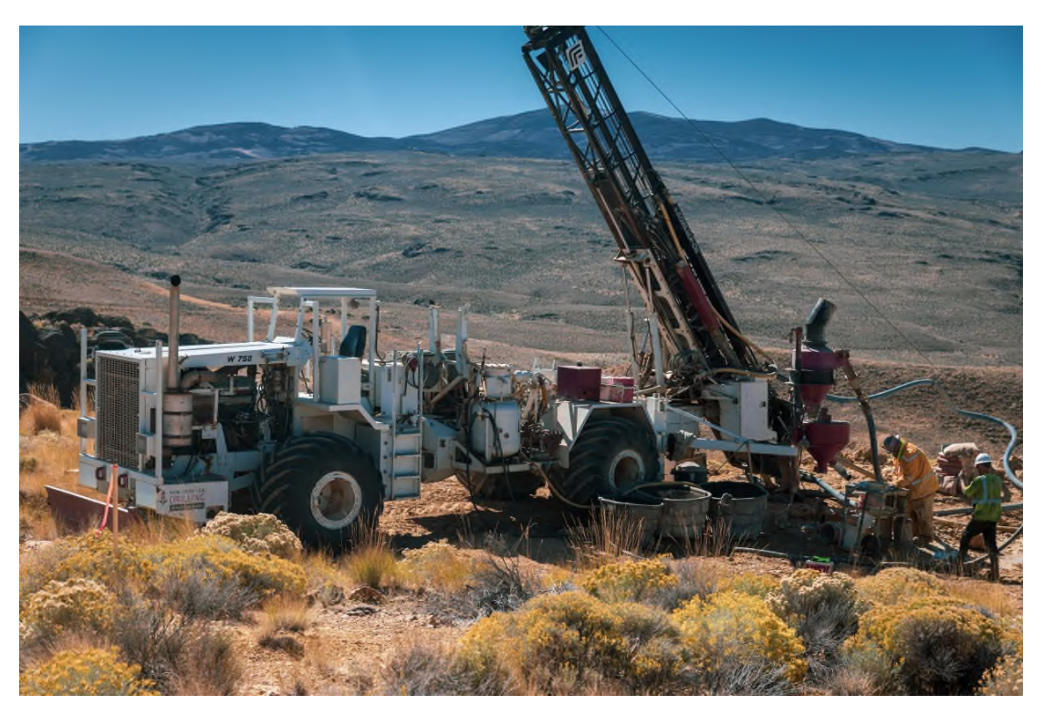
Figure 1: RC drill rig on the first hole at the Bells Area – Hog Ranch Gold Property

Rex Minerals Ltd (Rex or the Company) is pleased to announce that exploration drilling has commenced at the Company's Hog Ranch Gold Property located in Washoe County Nevada, approximately 180km north-east of the city of Reno and 90km north of the township of Gerlach, USA.