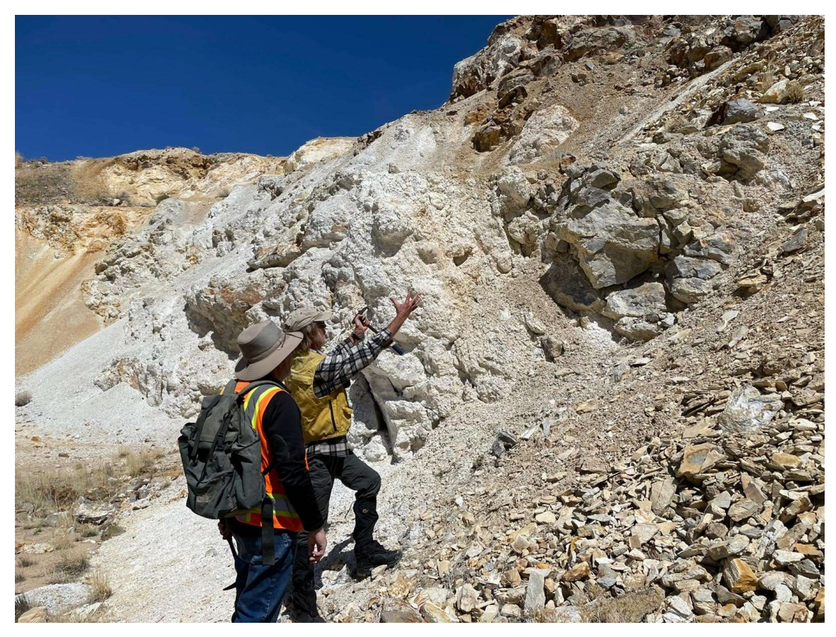
Figure 3 : Rex's consultants Simon Meldrum and Randy Vance at the Bells open pit.