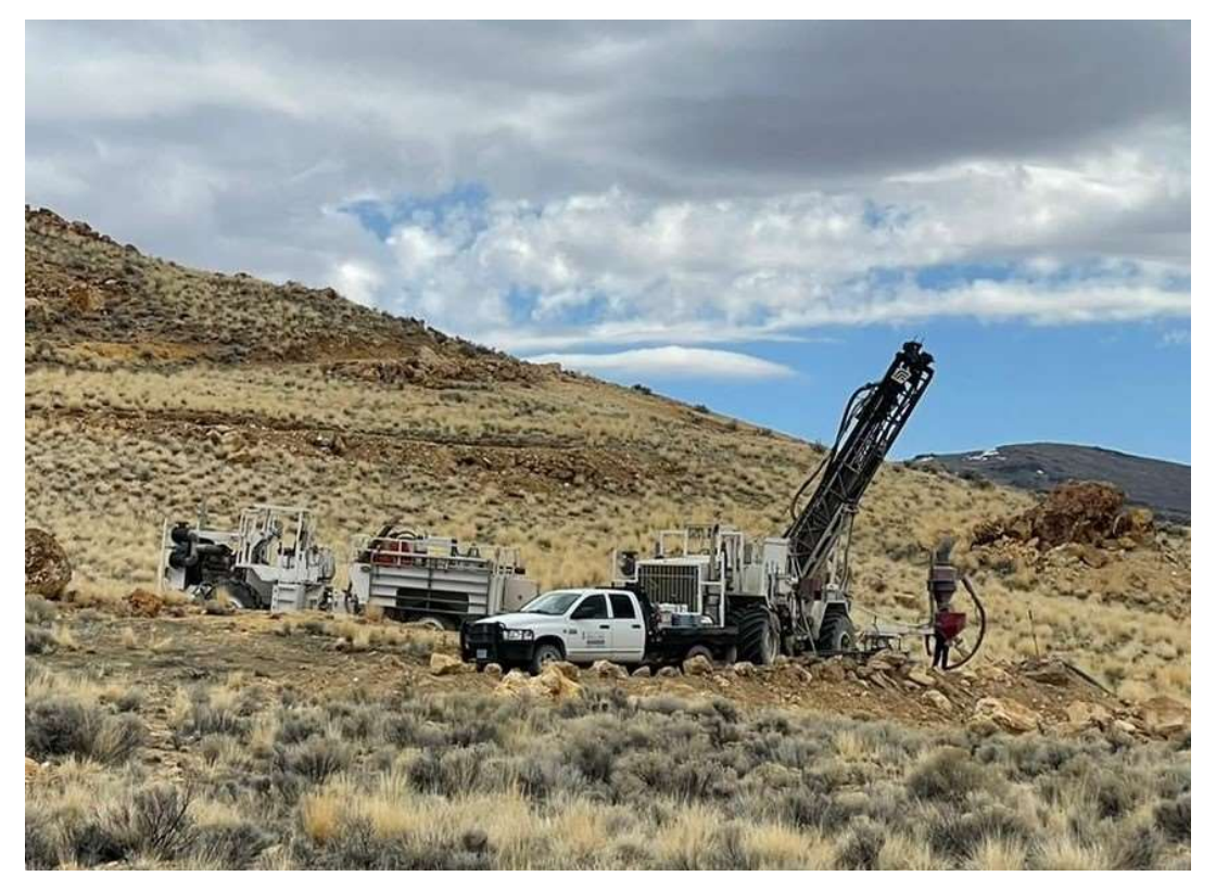
Figure 2: RC drill rig on the first drill hole (HR21-001) for 2021 at the Bells Project.